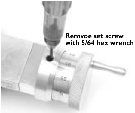
Remove set screw with 5/64 hex wrench

To access the base mounting holes in Series A15 UniSlides, you need to remove the end bearing block, slider and knob from the base.