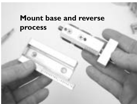
Mount base and reverse process

When reassembling, be sure to center the end bearing block and collar.