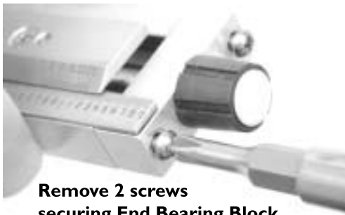
Remove 2 screws securing End Bearing Block