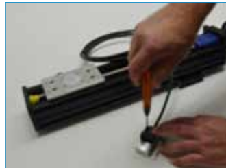
Attach sensor to reading head bracket. (1)