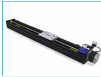
Velmex Motor-driven BiSlide