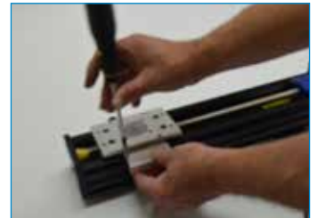
Mount reading head to side of BiSlide carriage. (2)