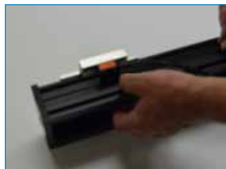
Carefully turn the BiSlide on its side.