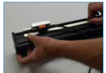
Press the strip down keeping it centered on the rib. (11)

NOTE: Once sticky tape and magnetic tape are applied they cannot be removed and repositioned, so make sure they are properly installed the first time. Two people may be required for longer applications.